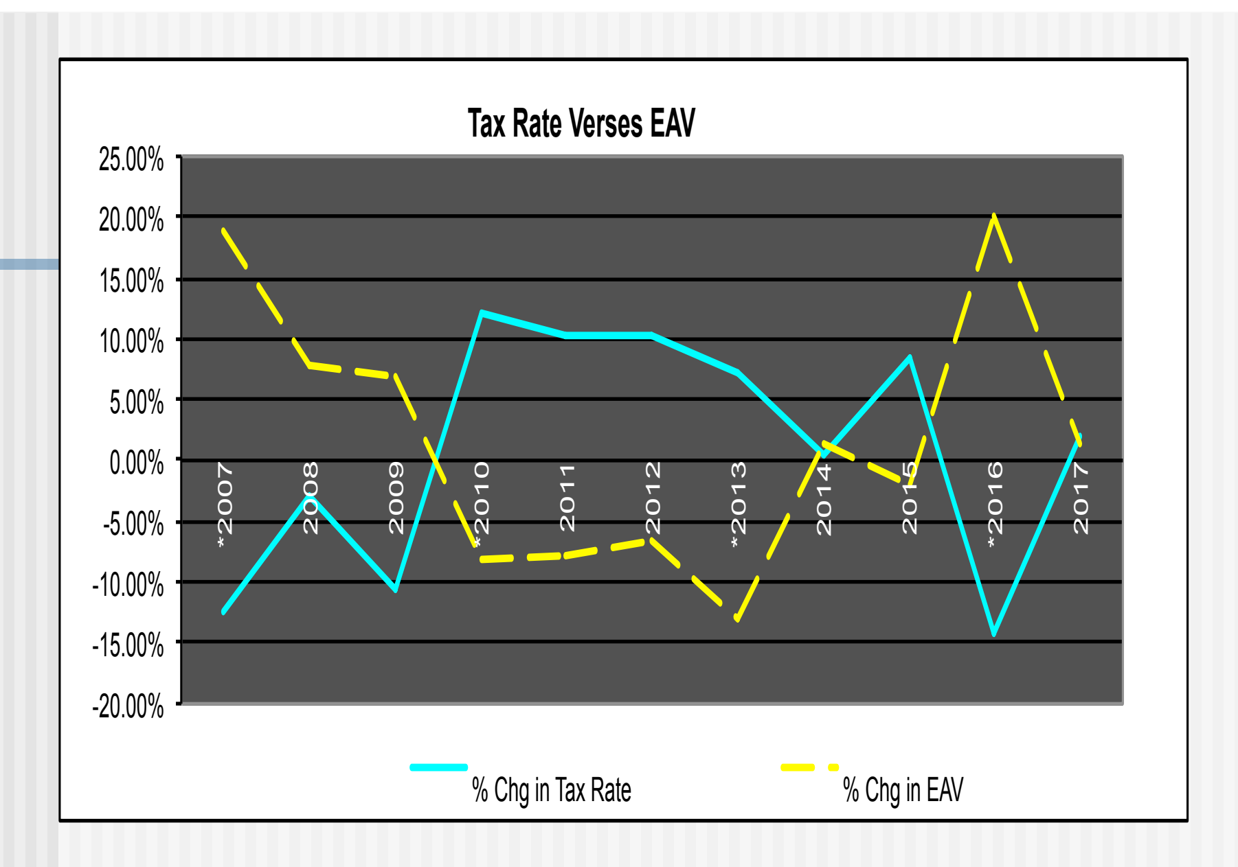
School District Tax Extension = Tax Rate Total EAV